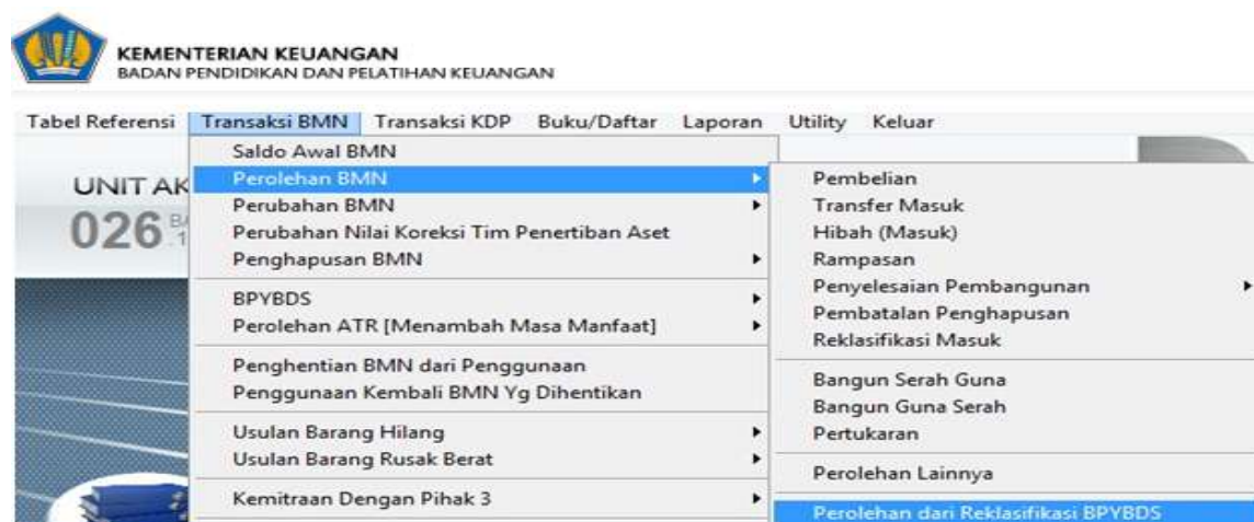
Figure Source 1: SIMAK BMN https://djpb.kemenkeu.go.id/portal/id/application-simak.html

SIMAK-BMN is carried out through a series of procedures, both manual and computerized, involving source documents such as SP2D/Contracts/BAST/Receipts, accounting organizations and accounting processes in order to produce various outputs required for both management and accountability of BMN such as Daily Transaction Details and BMN asset balances. . The BMN acquisition transactions in the Simak BMN Application provide information about the sources of asset acquisition which must be recorded by the SU PSA work unit as shown in the SIMAK BMN application menu as follows: